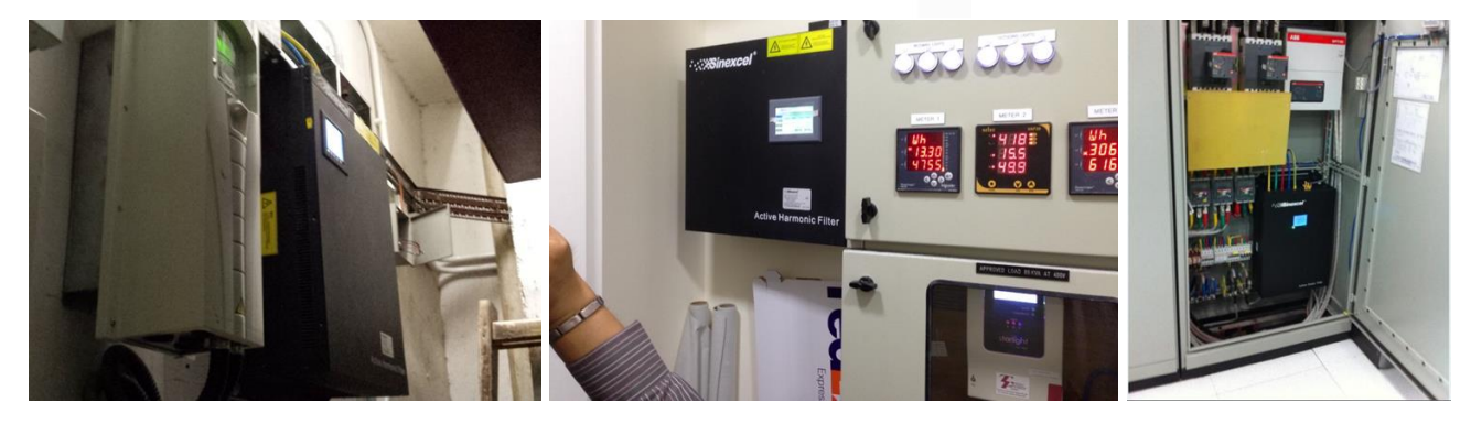
Fig 1. The compact size wall mount type of AHF being installed in confined space in electrical riser or tenant meter closet

Some of our references Active Harmonics Filter sites are: